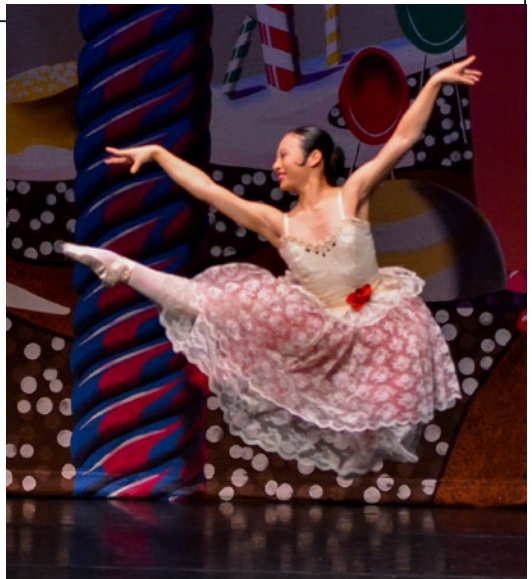
Advanced dancer in The Nutcracker