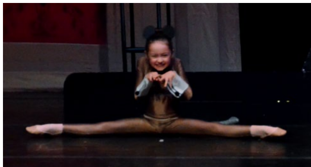
Ballet II dancer in The Nutcracker