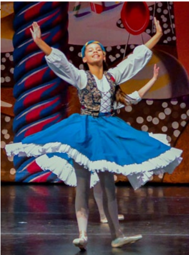
Ballet V dancer in The Nutcracker